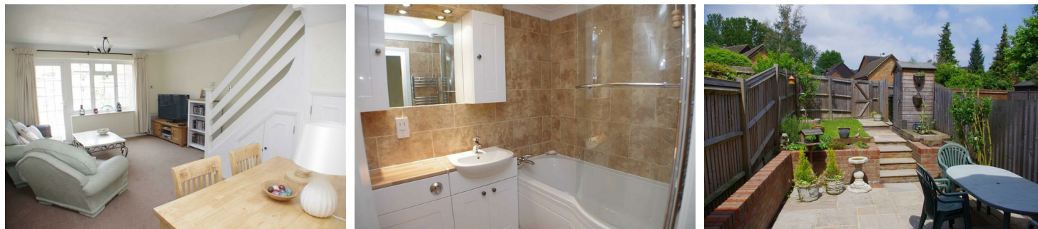
Ground Floor Approx. 31.7 sq. metres (340.8 sq. feet)

A refurbishment has transformed this attractive two double bedroom terrace property into a stylish home to be proud of and features a modern fitted kitchen, bathroom suite and recently installed double glazing. An ideal 'next step on the ladder', the property provides well proportioned living space throughout and is complemented perfectly by landscaped gardens. Other features include gas central heating and a garage-en-bloc. Larkwood Rise is a popular residential area in Jersey Farm and is within easy access of excellent local shops, amenities and eateries plus the City Centre is only a short distance away.